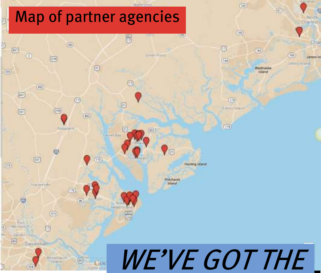
Map of partner agencies

And without you...we can't continue to serve them! We hope you share our joy in seeing our agencies succeed!